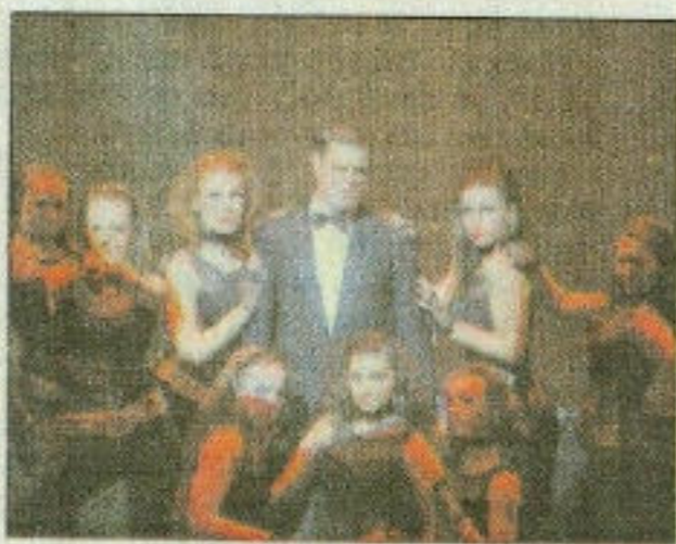
■ THE NAME'S BOND: Bond girls drape over the James Bond lookalike on stage.

One minute we were lost in a captivating world of magical creatures in The Enchantress or charmed by grace-