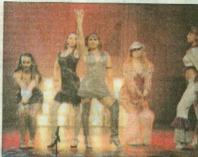
■ DISCO TIME: Song and dance routines with plenty of glitz in the Abba Medley .