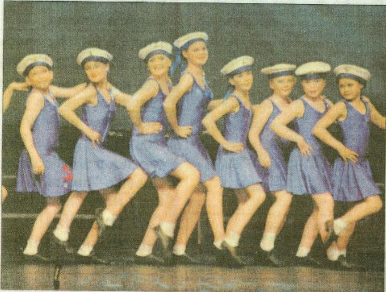
■ HELLO SAILOR: Stars of Dancing Feet on a Sea Cruise .

This was a three hour show but it's testament to the school that time flew by so quickly. I look forward to the next one.