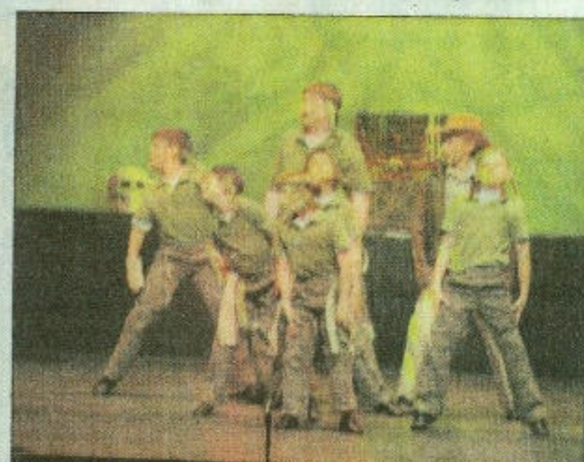
■ IN COMBAT: Athletic and energetic moves from the boys in an Indiana Jones routine.