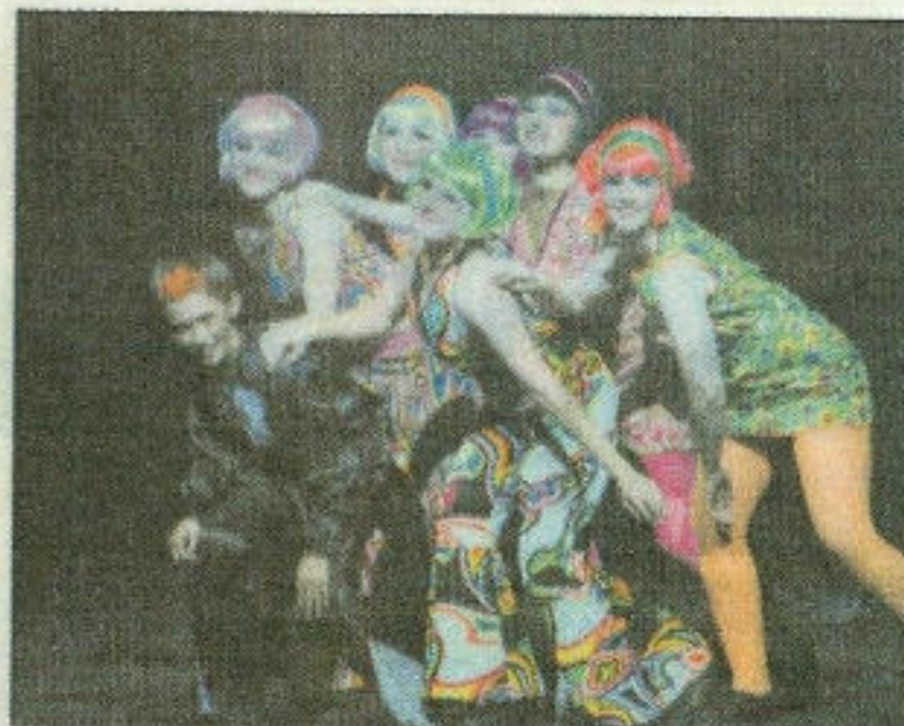
■ PSYCHEDELIC: Boogie Wonderland .