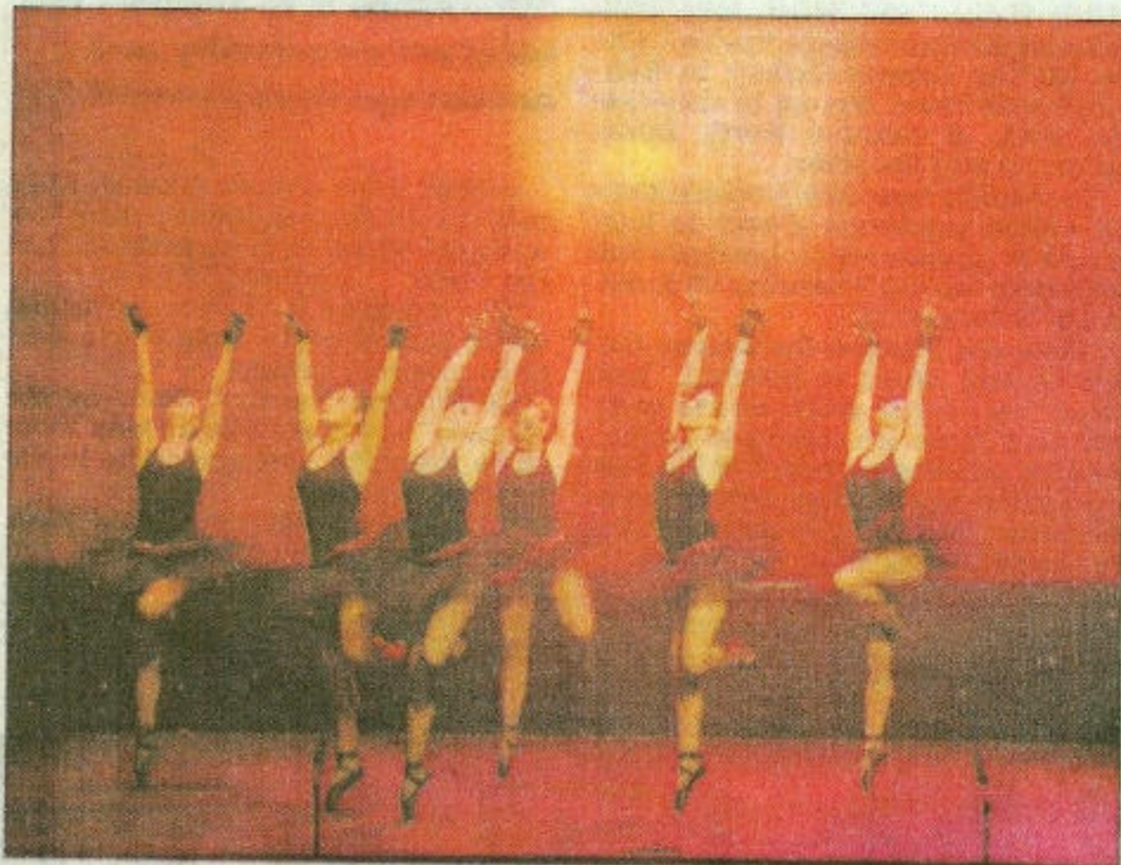
■ LICENCE TO THRILL: An arresting James Bond number in Another Way To Die .