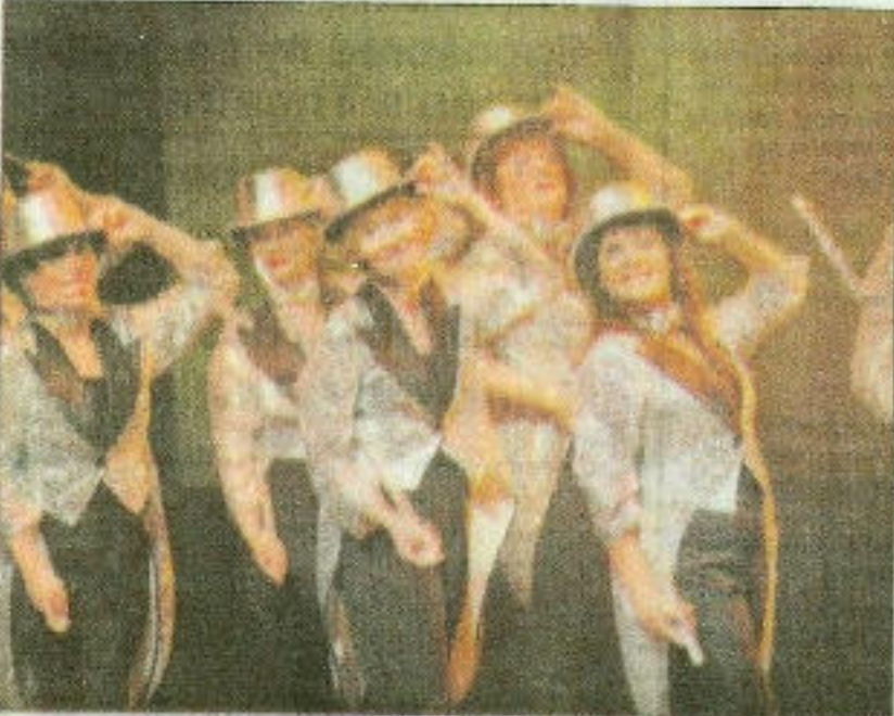
■ GLITZ AND GLAMOUR: Stepping out in style in Happy Feet .